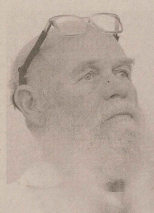
William Wharton in 2003.

"Not thinking of myself as a writer gives me the freedom to be one," he said in an interview with